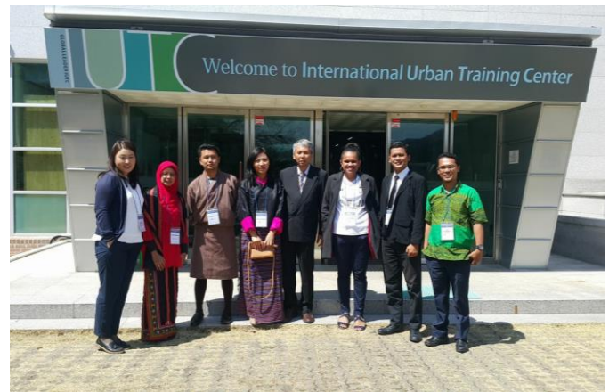
Participants from Mongolia, Indonesia, Bhutan and Solomon Island meeting on the first day of the training course.

Housing affordability is one of the greatest challenges faced by governments. The lack of affordable housing in cities is closely associated with the multiplication and persistence of slums and informal settlements, poor infrastructure, overcrowding, land and housing speculation and distress living conditions. Resolving accessibility to housing will immediately spin off to urban vitality and improvements in the quality of life in cities. The provision of affordable housing is a human rights matter that has been underscored internationally by more than 170 nations when reaffirming