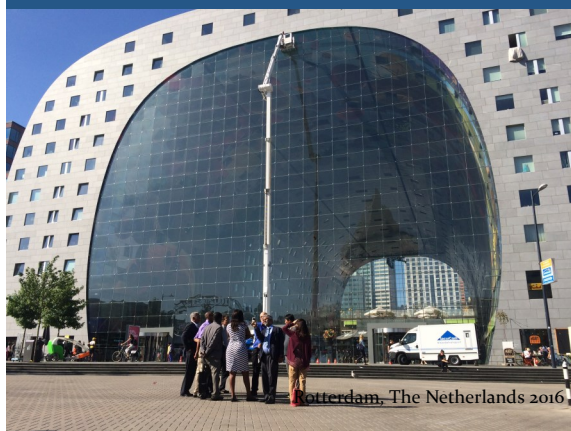
Preliminary Program at a glance

Case studies provided by participants will form the basis of the practical sessions so that participants will be able to learn from each other as well as benefit from the support of Arcadis and UN-Habitat's network of experts who will support implementation of priority actions.