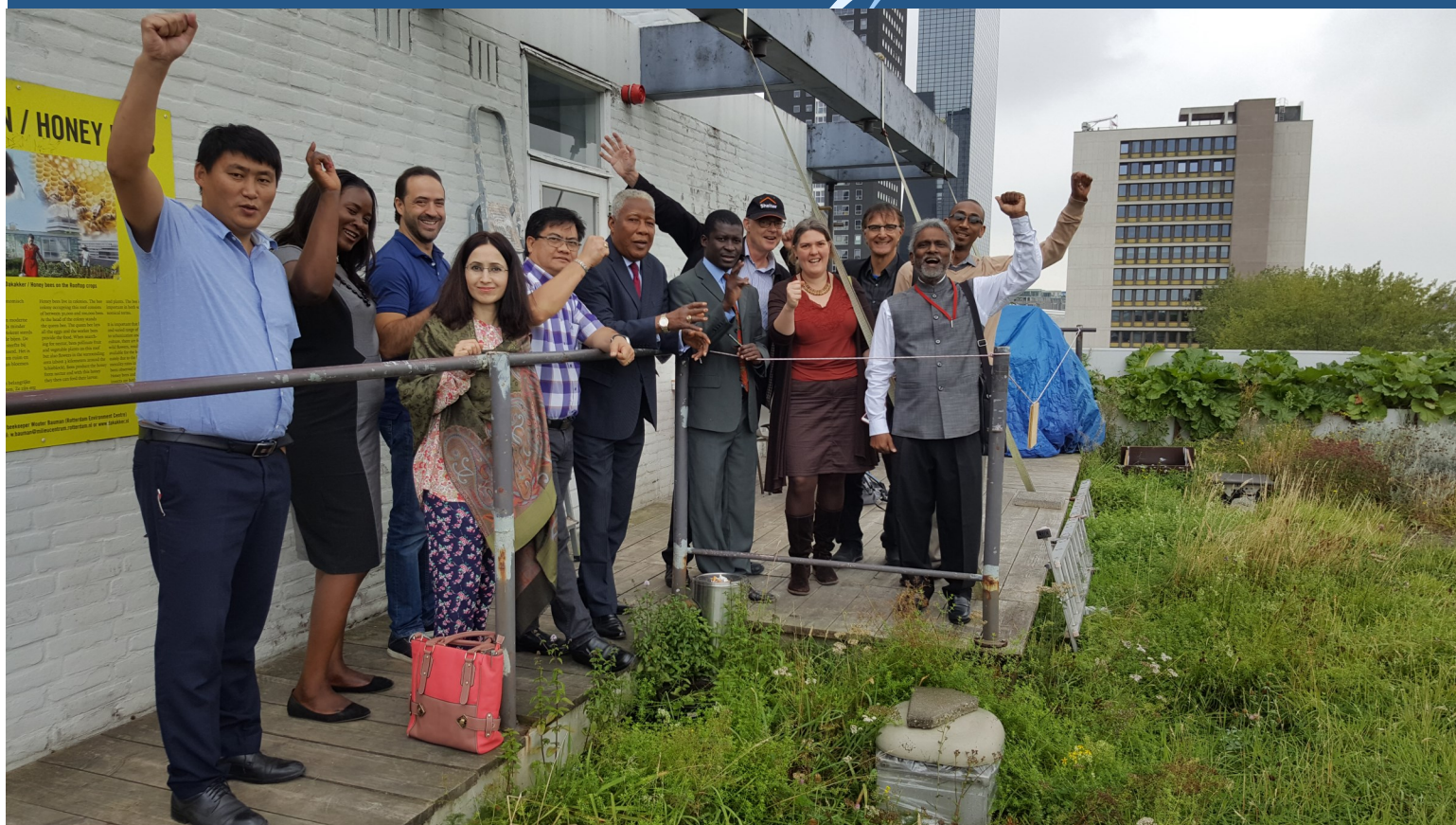
Rotterdam, Shelter Academy 2016

4 September – 8 September Amsterdam & Rotterdam, The Netherlands