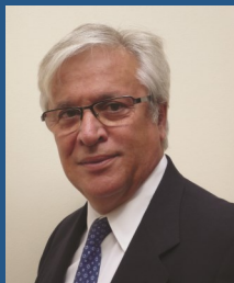
Dr. Joan Clos Executive Director, UN-Habitat

The Shelter Academy is part of Arcadis' commitment to the World Urban Campaign which is undertaken jointly in partnership with UN-HABITAT's Research and Capacity Building Branch. This annual event, now in its seventh year will provide leading cities from around the world with balanced approaches to realizing the goal of sustainable development by sharing expertise and know - how through South - South and North - South exchange. By focusing on the needs of senior local government officials and political leaders, the Academy will seek to impart knowledge and understanding of key trends - as well as the tools and solutions needed for responding effectively to urban challenges - while supporting practical development measures that address the needs urban citizens.