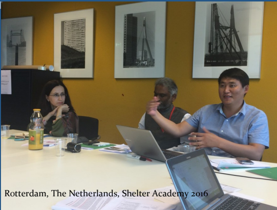
Rotterdam, The Netherlands, Shelter Academy 2016

4 September — 8 September 2017 Amsterdam & Rotterdam, The Netherlands