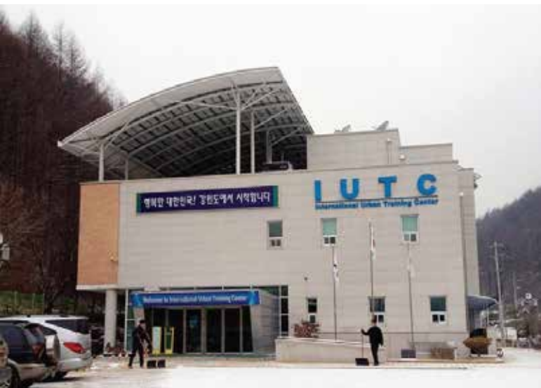
► International Urban Training Center (IUTC), Republic of Korea

experiences with indicators help participants to build their understanding of data, information and indicators in policy analysis.